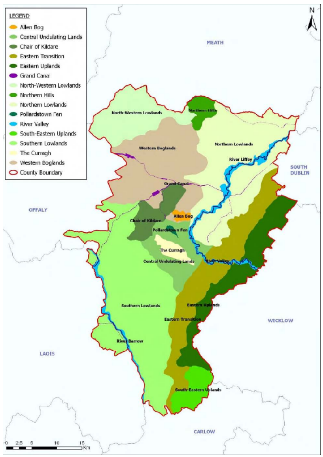
Figure 2.1: Landscape Character Areas

In order to determine the likely perceived impact of a particular development on the landscape Kildare County Council have included table 14.3 in the CDP in which the potential impact of a range of listed developments is viewed in light of the relevant LCAs. Table 14.3 of the CDP is reproduced below as Table 2.1, as can be seen this table details the likely compatibility between a range of land-uses and the principle LCAs. As can be seen from the table below there is a five-point range on the compatibility key from "least compatible" (purple), through low, medium and high, until it reaches "most compatible" (azure blue). The only use that is classified as "most compatible" in the Western Boglands is agriculture, whilst rural housing and urban expansion have